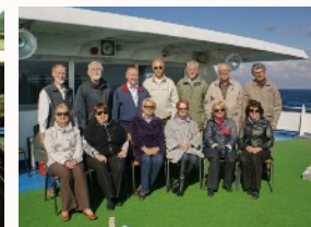
The cruise leadership team from four countries