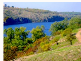
Insel Khortitsa at Zaporizhia