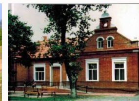
Mennonite Centre in Ukraine in Halbstadt,