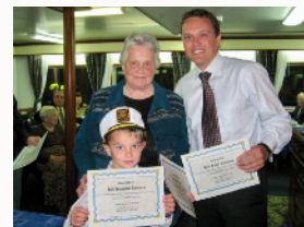
Floating Mennonite University Certificates